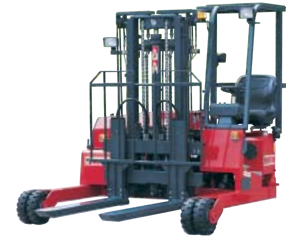
The model is fitted with a load backrest as an optional extra.